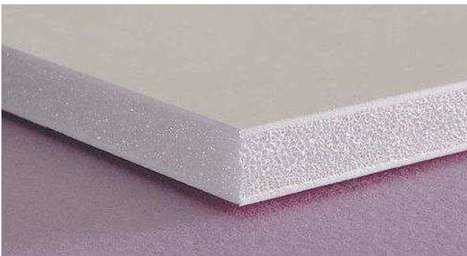
3/16" Foam Core