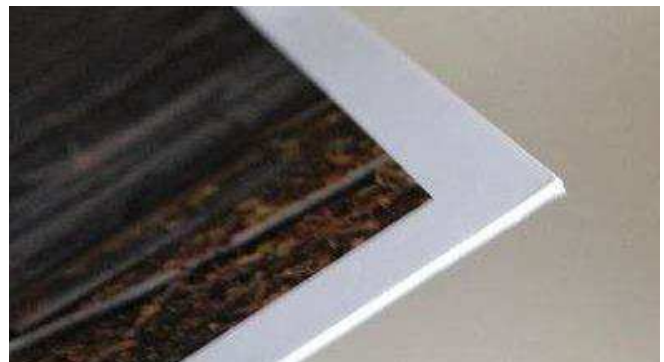
Costco Print Boards have white borders. This is an affordable and acceptable mounting